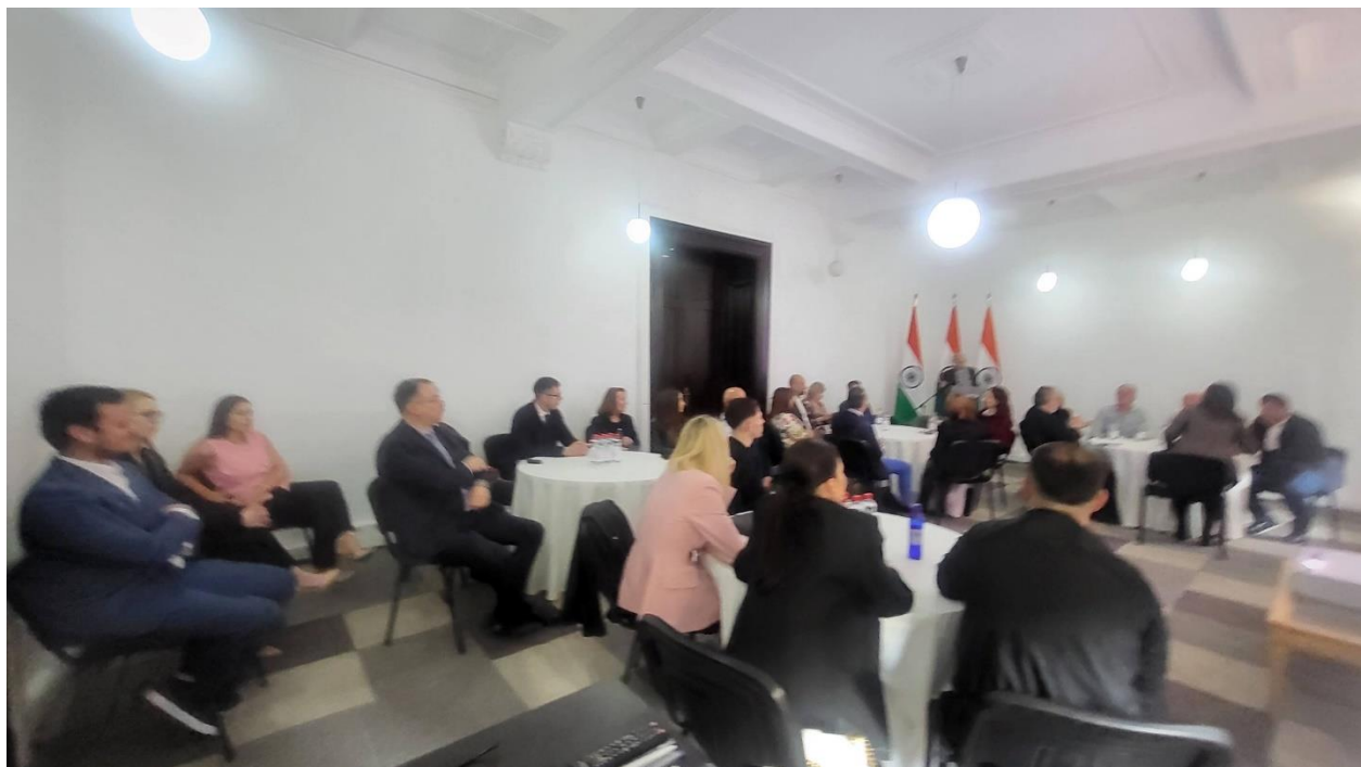
Romanian companies actively participated and explored opportunities with Indian firms.