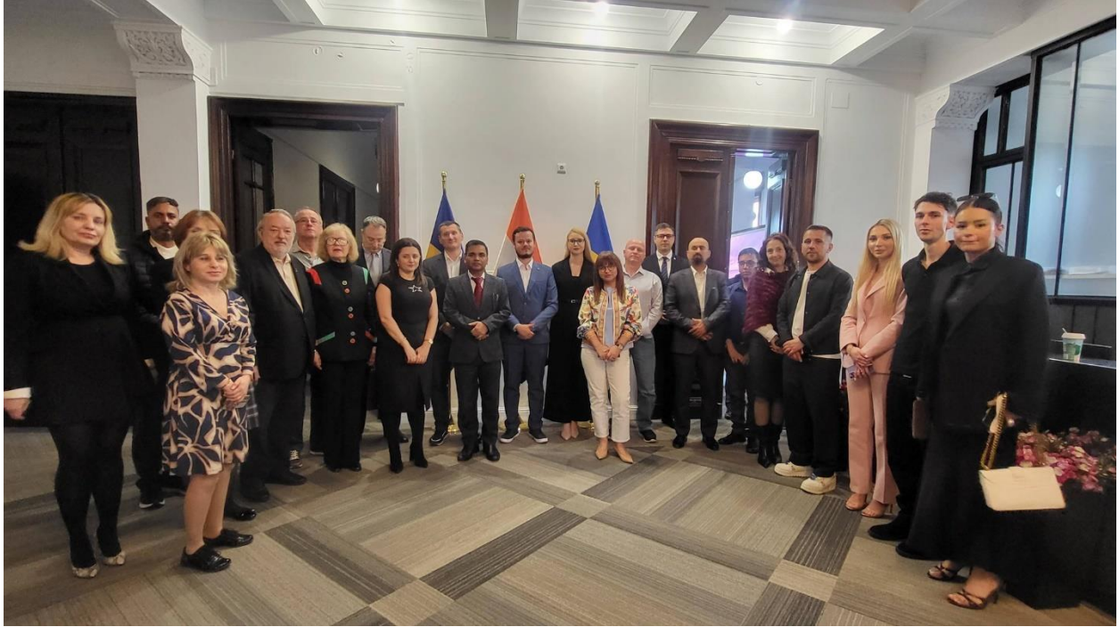
Group photo : Hybrid B2B Meeting on Construction(24 April 2026)